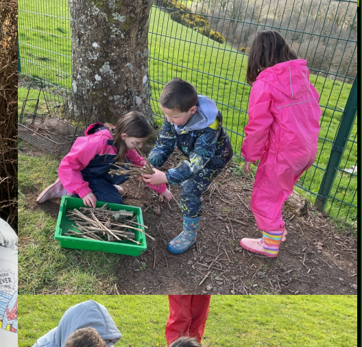
The children have sown all the wild flower seeds we have been donated all around the top car park. They have also collected twigs ready to put into the bug hotel.