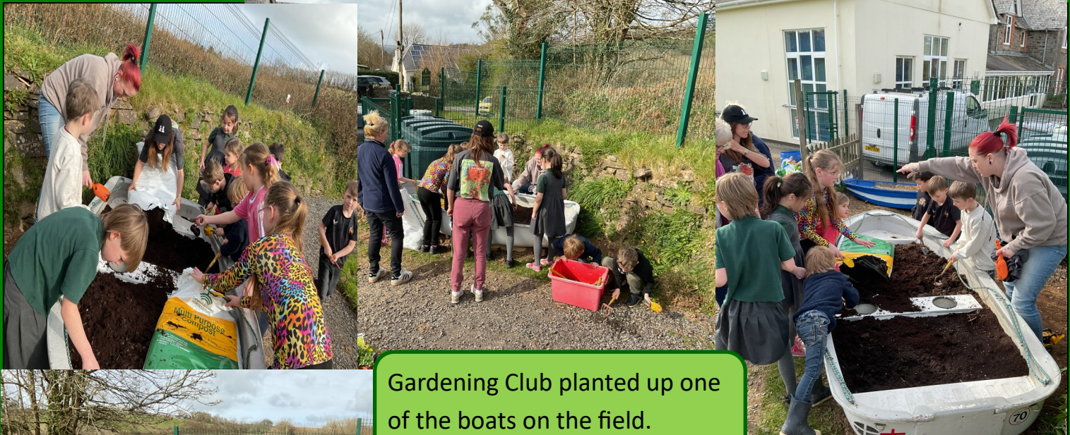
Gardening Club planted up one of the boats on the field.