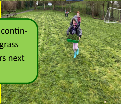
In Wild Tribe today the children continued to gather leaves, twigs and grass ready to fill the boat and planters next week ready for planting.