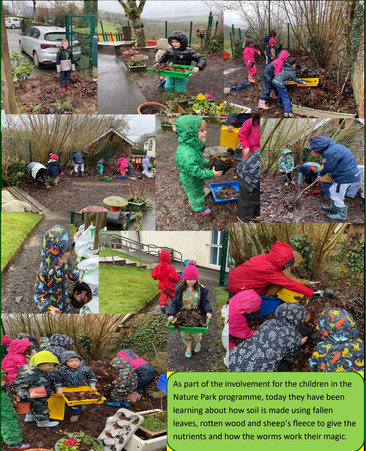
As part of the involvement for the children in the Nature Park programme, today they have been learning about how soil is made using fallen leaves, rotten wood and sheep's fleece to give the nutrients and how the worms work their magic.