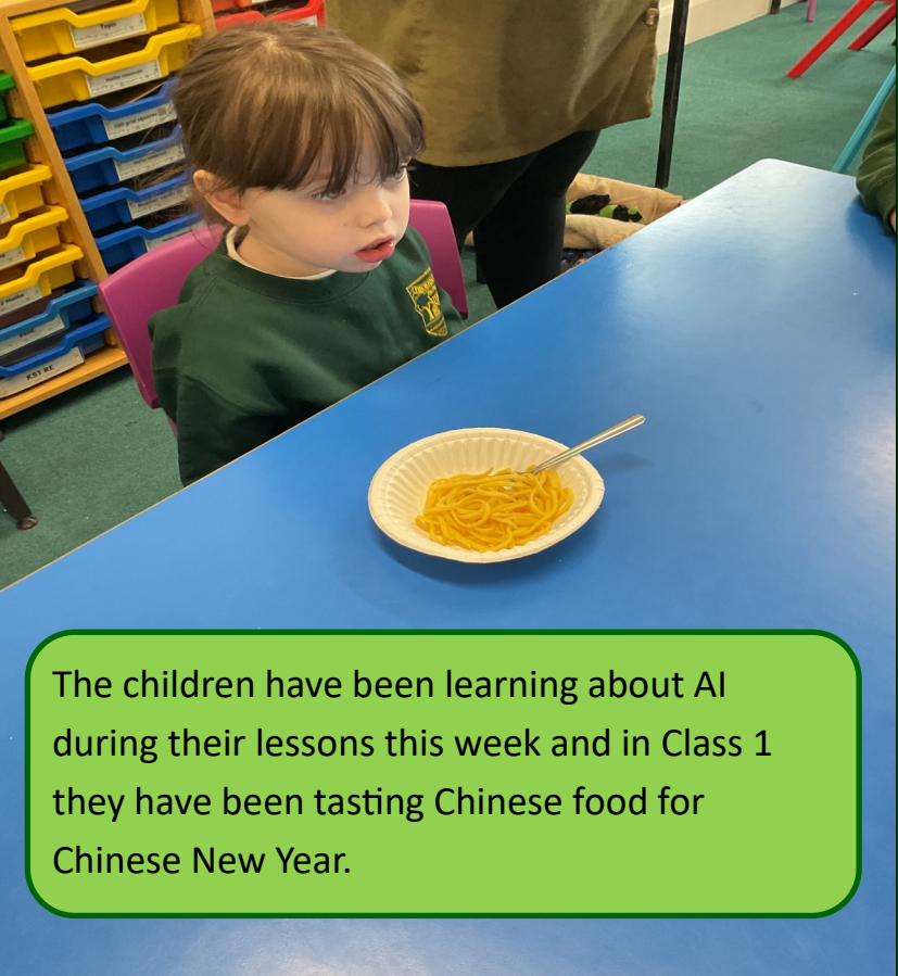
The children have been learning about AI during their lessons this week and in Class 1 they have been tasting Chinese food for Chinese New Year.